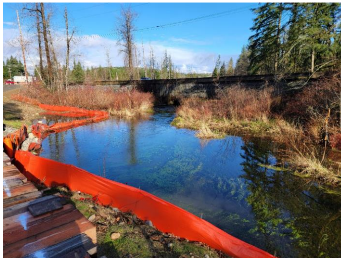
All creeks, tributaries, waterways, etc. appear clear and free of sheen at this time.